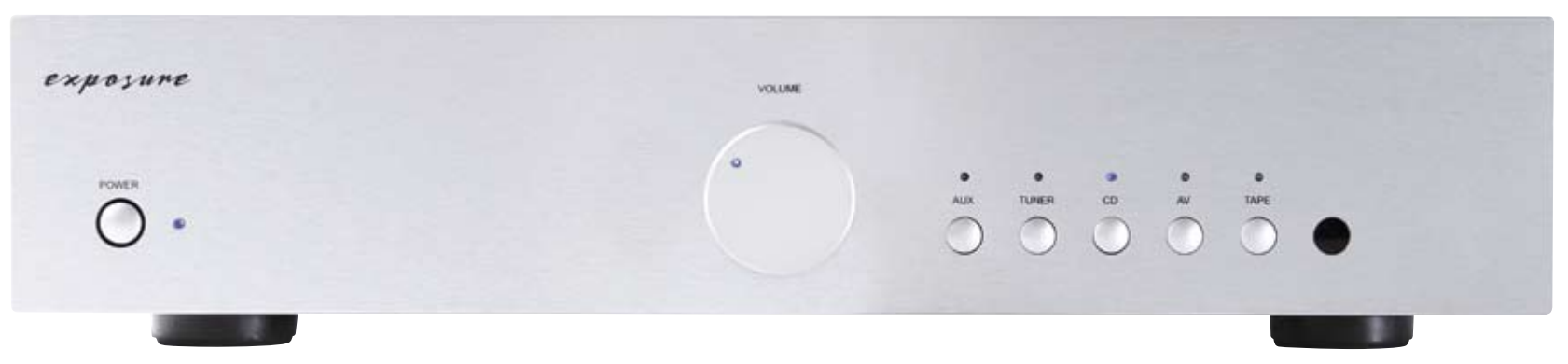
Exposure 1010 Integrated Amplifier: Front View