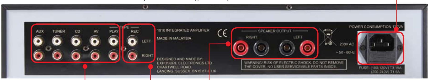
Exposure 1010 Integrated Amplifier: Rear View

The Exposure 1010 Integrated Amplifier is fitted with five-line level RCA Phono inputs, suitable for connection of CD players, tuners, recorders, DVD players and other source components.