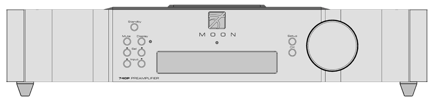
Figure 1: Front panel of MOON 740P Preamplifier

The front panel will look similar to Figure 1 (above). The large display window normally indicates the current volume level and, whenever you change the input, it will briefly show the selected input label.