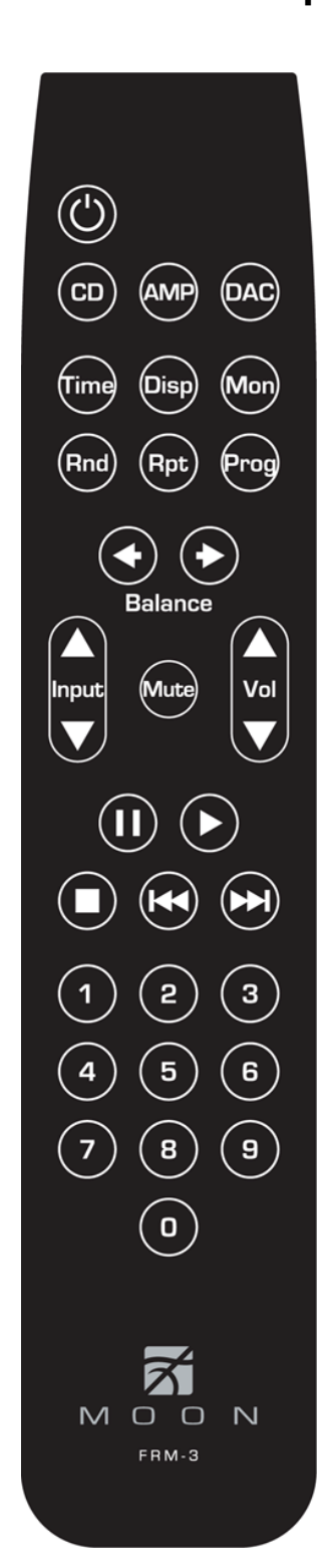
Figure 3: FRM-3 Remote Control

The MOON 740P Dual-Mono Preamplifier uses the 'FRM-3' full function, all aluminum backlit remote control (figure 3). It operates on the Philips RC-5 communication protocol and is can be used with other MOON components such as CD Players, DAC's, Integrated Amplifiers, as well as other Preamplifiers.