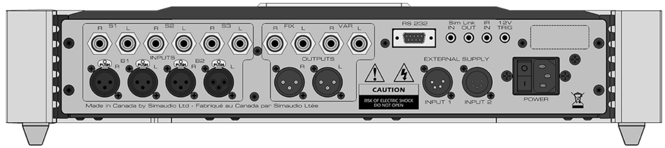
Figure 2: Rear panel of MOON 740P Preamplifier

The rear panel of the MOON 740P dual-mono preamplifier will look similar to Figure 2 (above). There are two rows of connectors; the top row contains three (3) pairs of single-ended RCA inputs labeled S1, S2, and S3 on the left side; In the middle section are two pairs (2) of single-ended outputs. One output pair, labeled "VAR" is a variable output and the other, labeled "FIX" is a fixed output that bypasses the volume control. You should always connect your power amplifier to the "VAR" output unless your power amplifier has its volume control that you intend on using instead of the 740P 's.