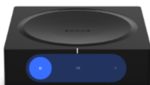
Next/Previous (Music only)